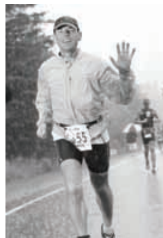
The Iron Friar

We will be having a Missionary visiting the parish and making a Mission Appeal. We will have envelopes available for your use.